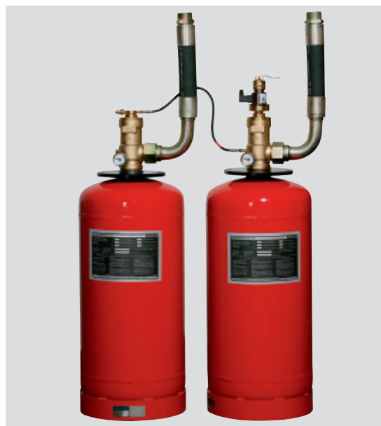
Example of a multi-cylinder system